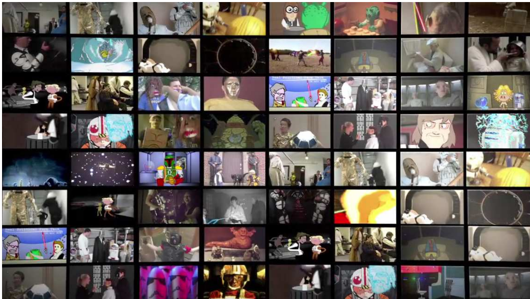
some of the many clips submitted from fans all over the world

Documenting the single most peculiar relationship between a popular artist and his fans called for a participatory approach. We are talking about a dominant cultural debate that refuses to die, and about one of the most powerful and influential filmmakers in the history of our medium—a man who defied the system against all odds and revolutionized the industry. The project's open call for contributions led to thousands of fan emails and submissions, including puppet skits, 3D animation, claymation, grindhouse commercials, vintage 8mm films, hours and hours of webcam rants, fanedits, fan vids, and even kids' drawings.